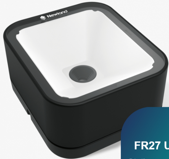
FR27 Urchin Stationary Scanners