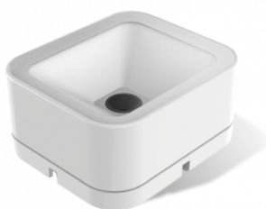
Available in white on request

Mindful that the FR27 Urchin can suit access control and kiosk applications, its case has a design that allows you to manipulate the cable for mounting portrait or landscape. It also has threaded fixing points for vertical mounting.