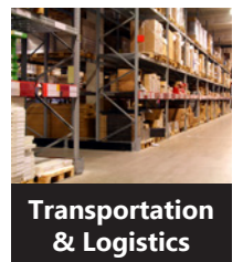
Transportation & Logistics