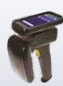
DLR-SLED01-EU RFID Reader Sled