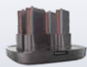
94ACC0192 4-slot Battery Charging Dock