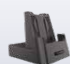
94A150095 Single Slot Charging Dock