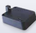
Ethernet Adaptors (Single: 94ACC0297 / Triple: 94ACC0288)